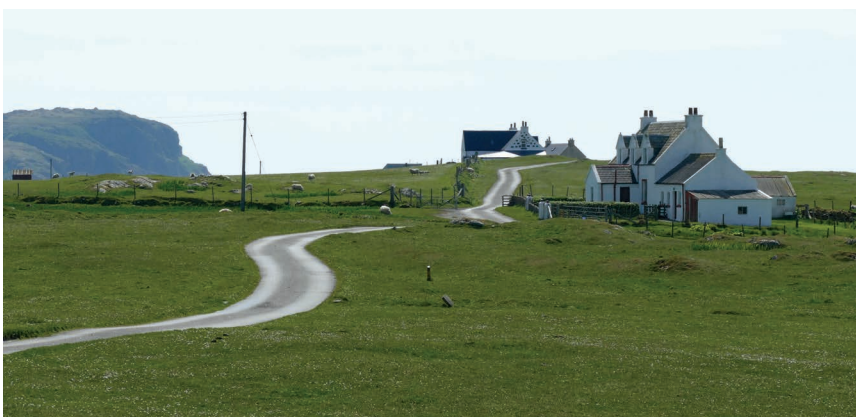
Island of Tìree, Scotland