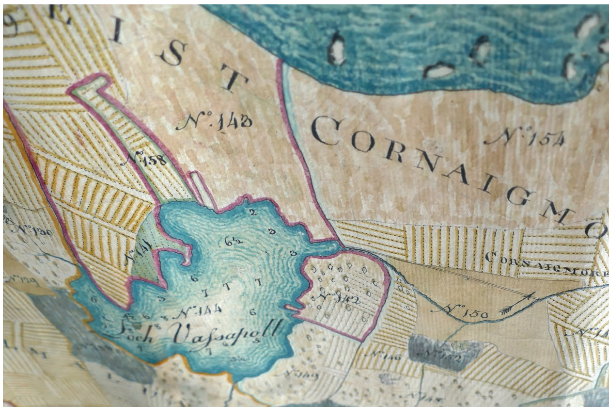
Turnbull Map (ref AP R038) detail