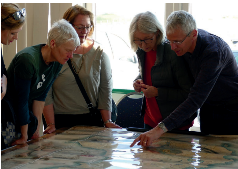
Members of the Tìree community pore over the Turnbull Map (ref AP R038) during the Archives Roadshow in May 2019

Alison had previously collaborated in a highly successful Archives Roadshow on Tìree in May 2019, as part of the Written In The Landscape project, including exhibitions, talks and workshops, and a dramatic performance by local school children. Of particular interest was the Turnbull Map of Tìree, a lavishly illustrated hand-drawn 18th century map of the island by James Turnbull. Enthusiastic community feedback asked for more.